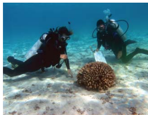
Observing water flow through Moorean coral

UCSB has three LTER programs—more than any other U.S. university. The Palmer LTER on the Antarctic Marine Ecosystem investigates the fish and animal ecosystem in waters where annual pack-ice fluctuations may affect every level of the food web. The Santa Barbara Coastal LTER protects living systems, especially giant kelp forests, in the ecologically and economically invaluable zone where ocean meets land. The Moorea Coral Reef LTER focuses on stony corals in the