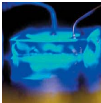
A $1 LED (light-emitting diode) light bulb is 20 times more efficient than incandescent

(ConvEne) trains graduate students to resolve challenging problems related to energy consumption. Worldwide, quality of life is directly related to consumption of energy. Our ability to tap into new (renewable) energy sources and to make more efficient use of existing (non-renewable) energy sources will be critical for maintaining quality of life in the United States and enable developing